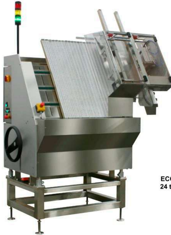
ECOM™ with standard 24 tray capacity shown